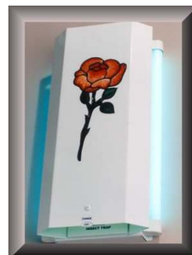
Made in Australia

180 degree visibility - attractive to flying insect pests. Easy replacement of sticky pads 2 x 15W U Straight Blacklight Tubes H 50cm W 25cm D 12.5cm