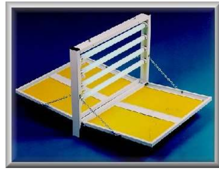
Made in Australia

Utilizes 4 sticky trapping pads. Can be mounted with one panel vertical and one horizontal for wall fit, or with both horizontal for Overhead chain suspension 4 x 15W Straight Blacklight Tubes Range 260m 2 66 x 52 x 52cm one panel horizontal 66 x 95 x 52cm two panel horizontal