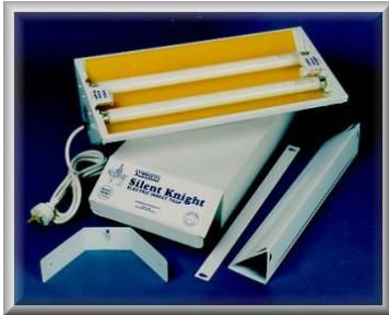
Made in Australia

Attracts and traps flies and other insect pests 2 x 15W U Straight Blacklight Tubes Range 30-50m 2 L 47cm D 23cm H 9cm