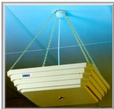
Made in Australia

A suspended down light, ceiling mounted fixtures with 2 concealed trapping pads. 4 x 15W Straight Blacklight Tubes Range 180m 2 H 52cm W 52cm D 14cm