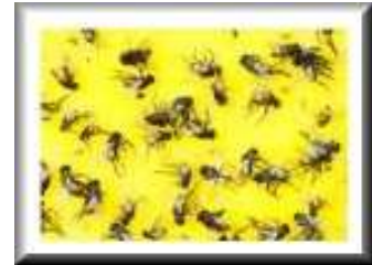
Made in Australia

One pad 430mm x 250mm SKP.10B Blue replacement sticky pads