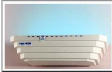
Made in Australia

Looks like a decorative wall light Soft beige colour suits most interior colour schemes. 2 x 15W U Straight Blacklight Tubes Range 30-50m 2 L 50cm D 25cm H 12cm